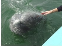
Pet a Whale!