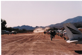
50 Aircraft in search of the mighty Grey Whale!