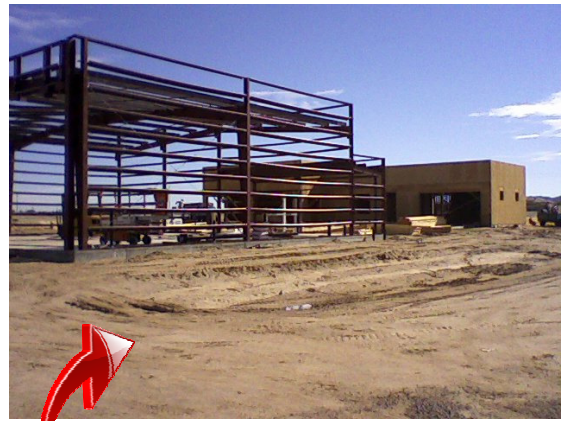
Aviation lots. build the dream!.