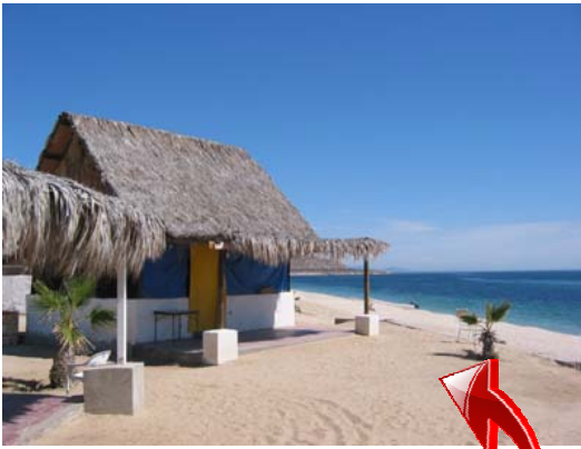
Remote and off MLS airstrips.