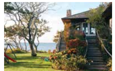
Passamaquoddy Avenue, Martha's Vineyard, $3.95M

MARTHA'S VINEYARD MEDIAN LIST PRICE: $679K, UP 31 PERCENT