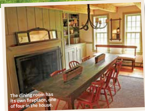
The dining room has its own fireplace, one of four in the house.