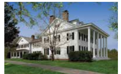
Shunpike, Millbrook, N.Y., $17.5M

DUTCHESS COUNTY, N.Y. MEDIAN LIST PRICE: $260K, DOWN 6.8 PERCENT