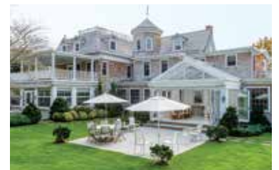
First Neck Lane, Southampton, N.Y. $18.25M

SOUTHAMPTON MEDIAN LIST PRICE: $1.3M, DOWN 3.7 PERCENT