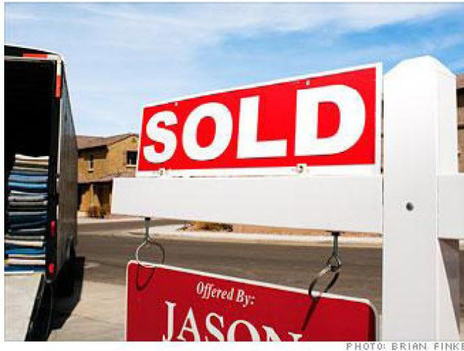
A home off the market in Mesa, Ariz.

The true disaster areas for housing since the bubble burst have been Sunbelt cities such as Las Vegas, Phoenix, and Miami -- places that boasted great job and population growth in the mid-2000s, only to suffer a housing crash that swamped them with empty homes and condos and crushed their economies. But people always want to live in those sunny locales, and their job markets are starting to recover, albeit slowly. In foreclosure markets the inventory problem is far greater because it includes not just traditional resale homes but millions of distressed properties. Fortunately those houses are now such a screaming deal that investors, including lots of mom-and-pop buyers, are purchasing them at a rapid pace. To be sure, some foreclosure markets won't rebound for years because they're both vastly overbuilt and far from big job centers; a prime example is California's Inland Empire, a real estate disaster zone 80 miles east of Los Angeles.