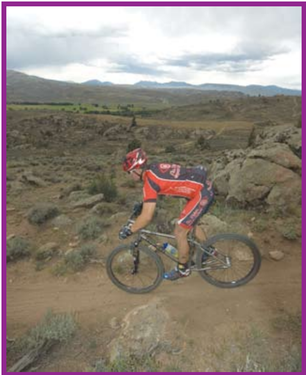
24 Hours in the Sage, Hartman Rocks

Copyright Go To Guide 2007 Reproduction not allowed without written consent. Maps may not be to correct scale or up to date.