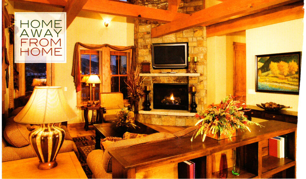
The Porches, Steamboat Springs

LOCATION: Steamboat Springs OFFERING: Currently, six four- and five-bedroom units ranging from 3,100 to more than 5,000 square feet with plans calling for 28 fractional residences to be complete at build out. PRICE: 1/8 ownership shares start at $375,000. USE: Three weeks of use in summer and three weeks in winter, plus additional time based on availability. CONTACT: 866.500.6673; theporches.com With just 84 residences being built across 20 acres of mountainside land, The Porches is widely unique. "The idea was to make it feel more like a community and less like a condo project," says co-developer Richard Dean. The front porch built onto each home and the community's uncluttered views up Mount Werner, do just that.