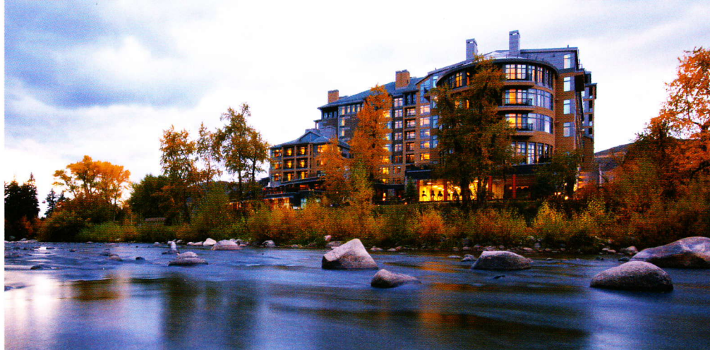
Westin Riverfront, Beaver Creek

This spring, the fractional villas at the Westin Riverfront will open and with it comes the opportunity for owners to access all of the resort's amenities—three riverside hot tubs, the 23,000 square foot Spa Anjali, connection to Beaver Creek Mountain via the