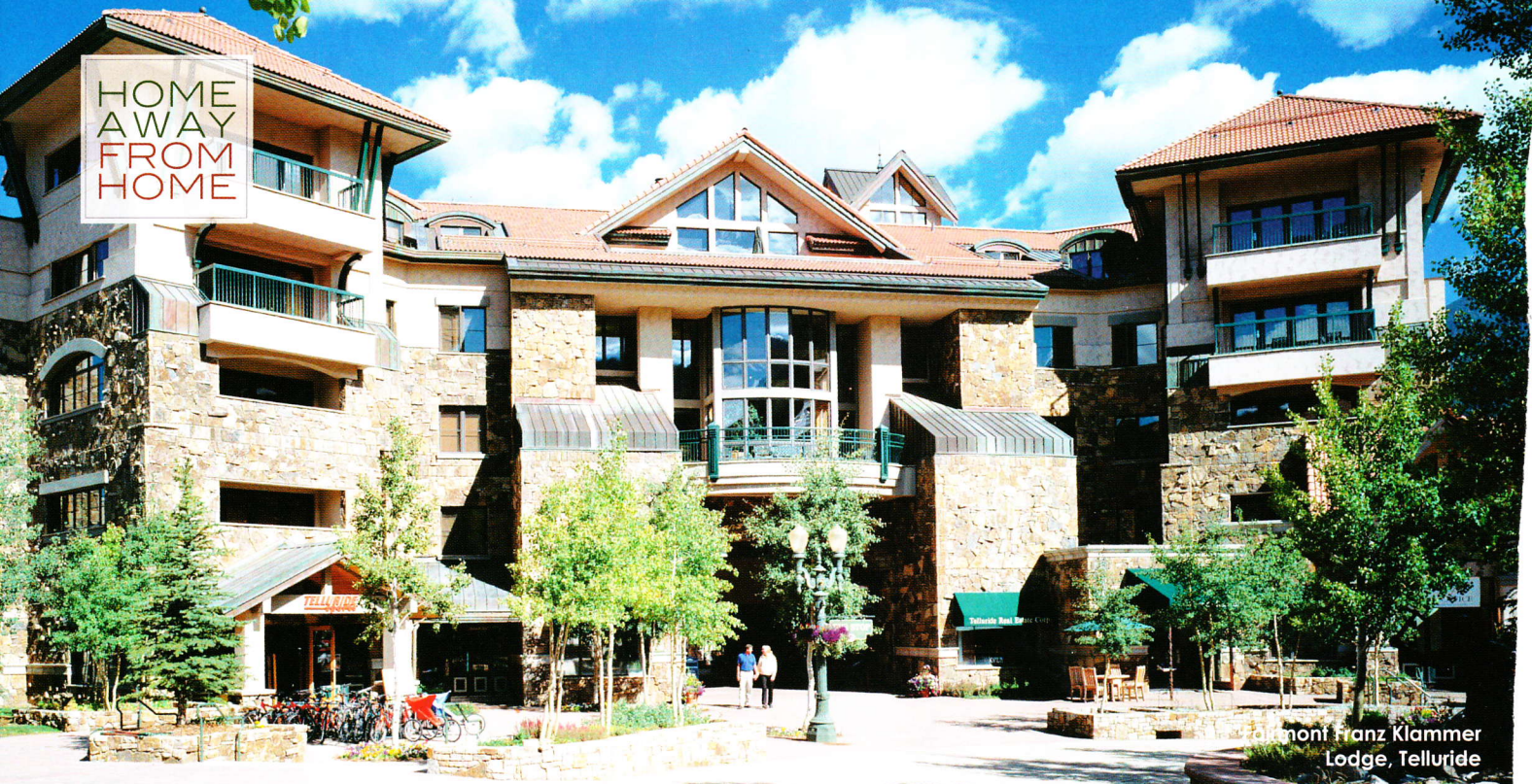
Fairmont Franz Klammer Lodge, Telluride