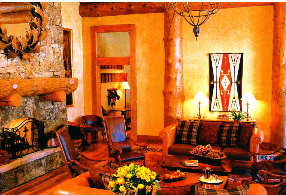
The Ritz-Carlton Club, Bachelor Gulch

The first of Dancing Bear's two downtown Aspen buildings, named Parkside, opened this January. Owners at both will enjoy a lounge with hot tubs, a bar and mountain views on the roof, while downstairs they will find a wine cellar, movie theater and restaurant.