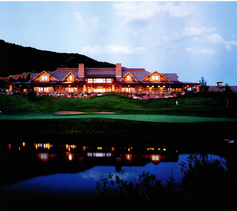
Roaring Fork Club, Basalt

LOCATION: Telluride OFFERING: 20, three- and four-bedroom residences ranging between 2,600 and 3,100 square feet. PRICE: Ownership shares priced at $799,000. USE: Unlimited use comes with space availability guarantee. CONTACT: 866.374.0689; clubattristant.com The capacity management system at Tristant and its sister property, Solaris, limits the